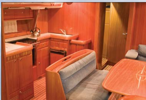
A spacious saloon (top) leads into the main cabin (top right) and contains the well-equipped chart table (right).

Bavaria has one of the most advanced, efficient and automated production processes in the world. Producing a range between 30' and 50' and over 2000 yachts per year, the labour cost is a mere twelve per cent yet they don't compromise on quality (the hull is still hand-laid with biaxial fibreglass). As regional dealer for Bavaria, Horizon Yacht Charters deals